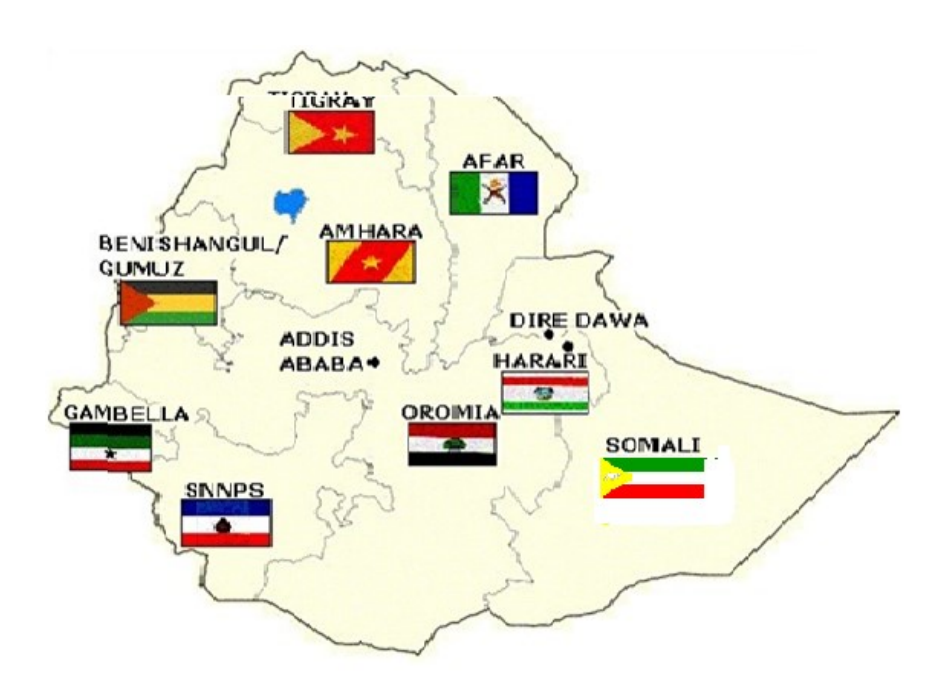
Figure 1. Map of Ethiopia